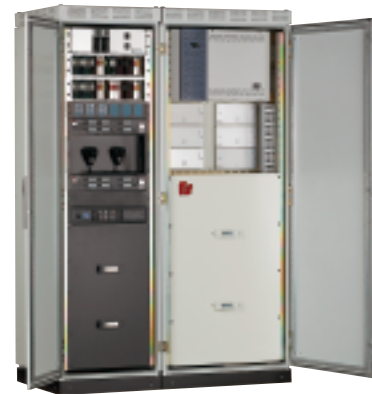
Rack Mounted ECHO System