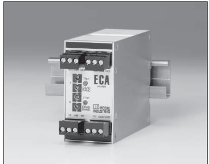
Compact durable aluminum housing snaps quickly and securely onto standard G-type and Top Hat rails.